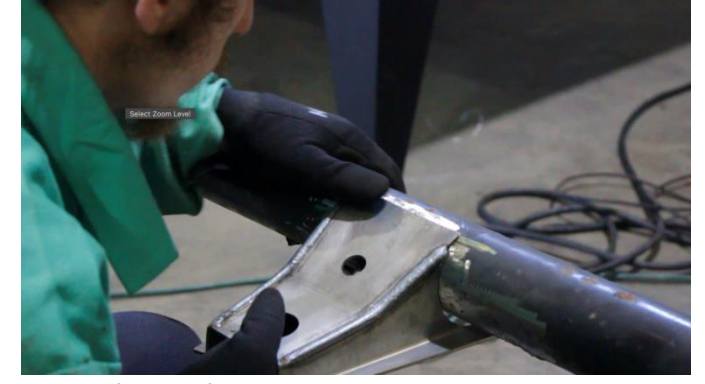
NOTE: If other frame repair components have been installed previously, additional modifications to the frame may be required.

Hold the new bracket up to the front cross member in line with orientation lines previously marked.